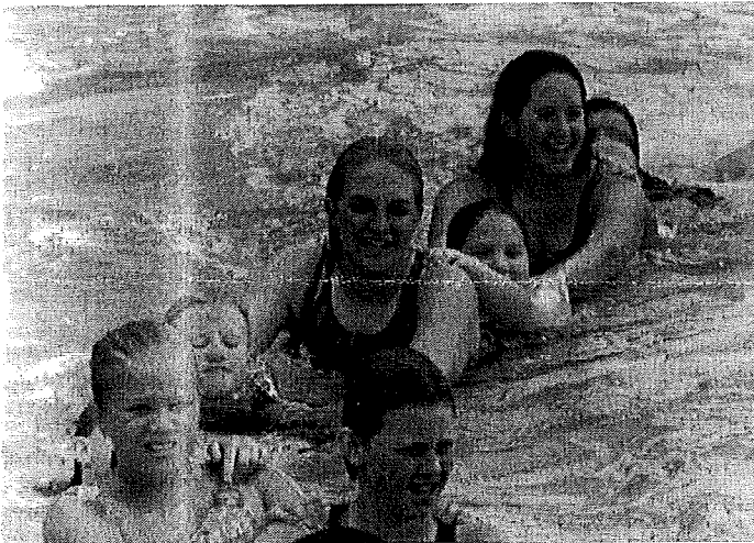
High school students enjoy fun in the sun at the pool with their campers. High school students can serve as counselors-in-training through the Youth Missions Corps.

Written for the supporting churches and friends of Cooperstown Bible Camp